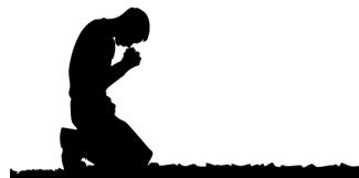
“... The effectual fervent prayer of a righteous man availeth much.” (James 5:16)

just as Elijah did. The key to Elijah’s powerful prayer was his willingness to pray perseveringly according to God’s Word that came to him (see 1 Kings 17:1; 1 Kings 18:1, 41-46). He believed the word that God spoke to him and went into prayer expecting God to perform it. And